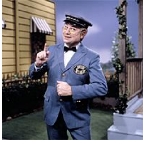
David Newell, a.k.a. Mr. McFeely

And if that is not enough, David Newell will be appearing as Mr. McFeely in the Marketplace during the grand opening Wednesday evening.